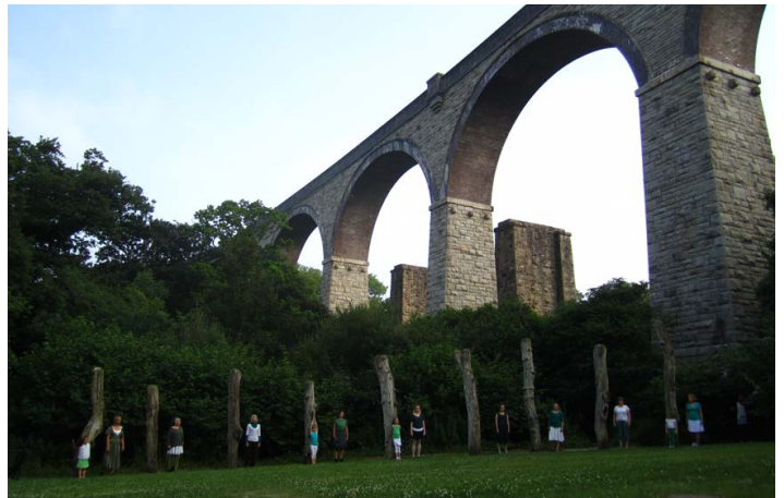
The distance that connects us (2013) Choreographic commission for Penryn Arts Festival