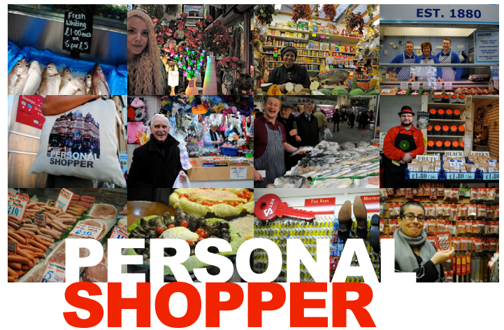
Personal Shopper (2014-2016) Exploring the network of personal relationships between shoppers, food and traders at Leeds Kirkgate Market in Personal Shopper, a 3 year project commissioned by Compass Live Art.