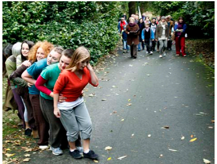
Penryn Pathways (2010) A site specific processional dance performance linking Penryn town with the University through bringing the pathway that connects the two to life, working with students from Penryn College, recent graduates and local community members.