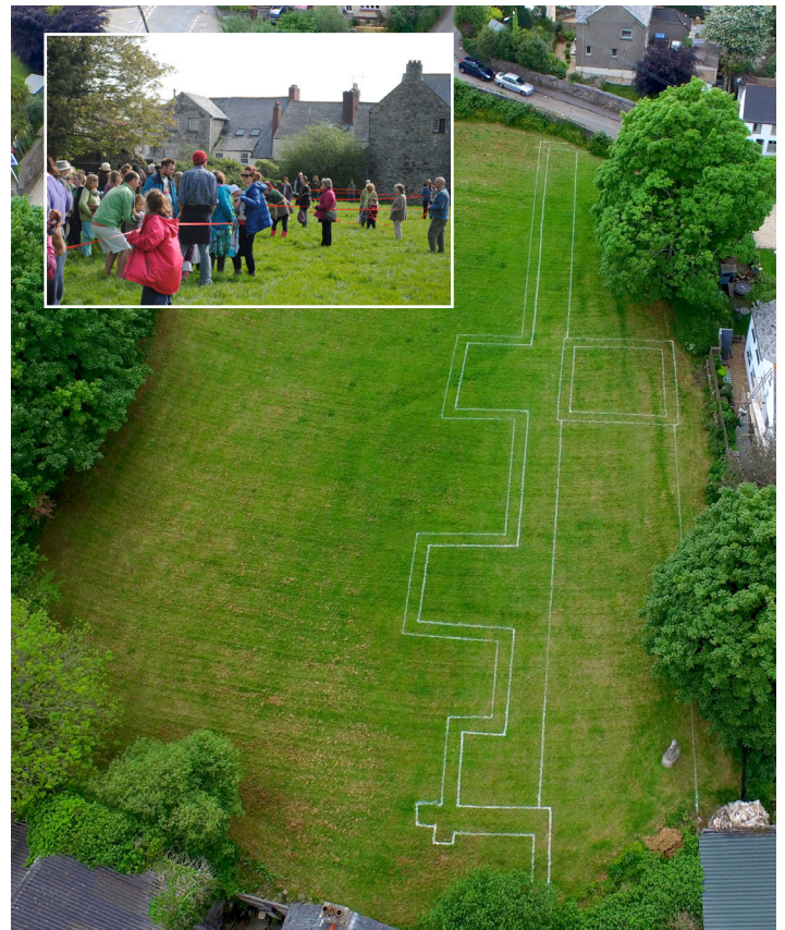
In Polsethrow shall habitations or marvellous things be seen (2015) Awakening an 'invisible' building in the 750th year of its founding.