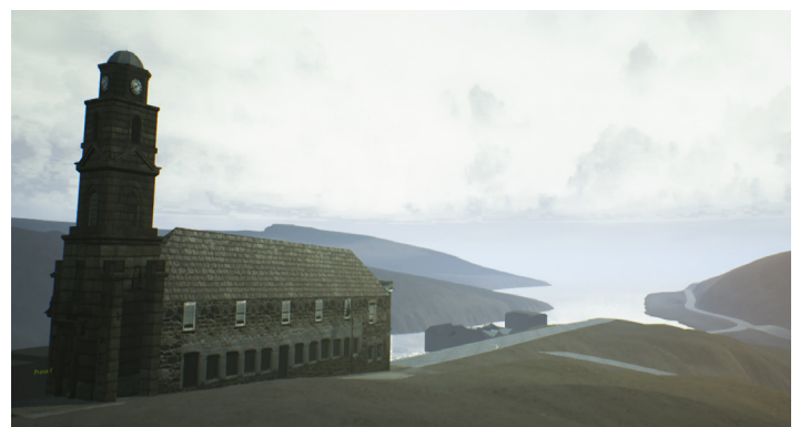
Prototype of 3D virtual landscape of Penryn An as yet unpopulated version of the town with all the existing buildings removed apart from the town hall.

Please note, the funds applied for are to develop and populate this prototype through training and facilitating members of the community to re-imagine Penryn.