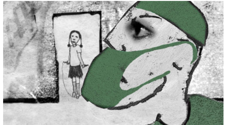
'Lonely Boy' Animated film 1'40" Universal Networks, selected Edinburgh & short listed Best British Short BAA Awards 2002