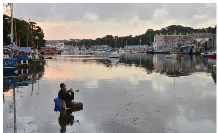
T-Rex Cinema (top left) an experimental art cinema in a rural community setting was part of the Penryn Arts Festival (top right and above) a combined arts festival in Penryn, Cornwall (2013)