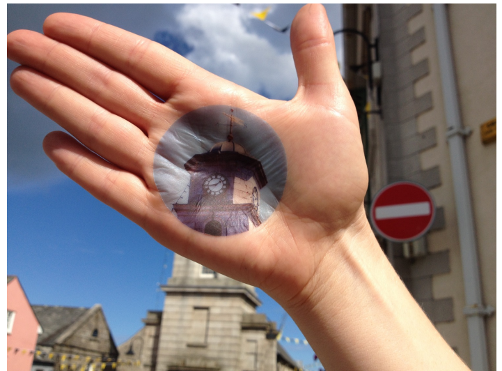
Porous Penryn (2014) Investigating the textures, histories and viewpoints of the places we pass through daily, by inviting residents to 'wear' their town or city in the form of a temporary tattoo [Porous City 2011-2014].