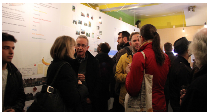
The Living Archive Community conversation space & mapping project