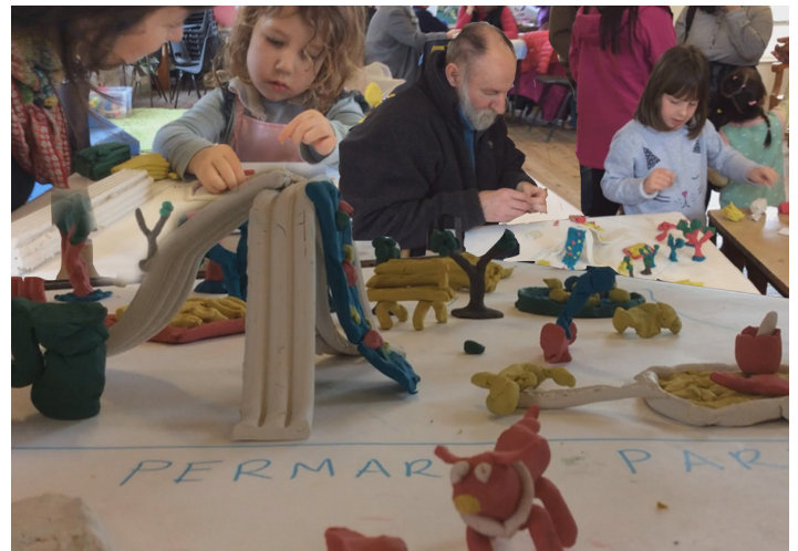
Permarin Pocket Park, Penryn Stop-motion animation ideas workshop