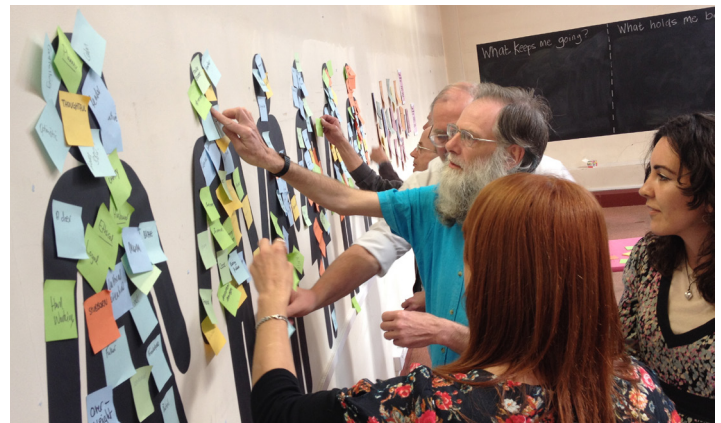
Exeter Wellbeing Hub (with Encounters Arts) 2015