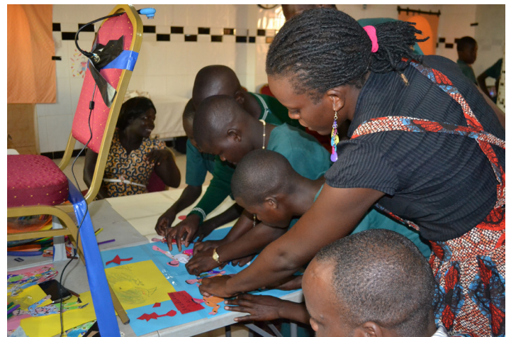
War Child & TPO Uganda Animation workshop (2015)

3D3 Doctoral Studentship, Plymouth University (2016-); PGCE, Falmouth University (2011); Masters in Animation, Royal College of Art (2001); Stone Carving (City & Guilds) London Art School (1994); BA Honours Fine Art, Norwich School of Art (1991)