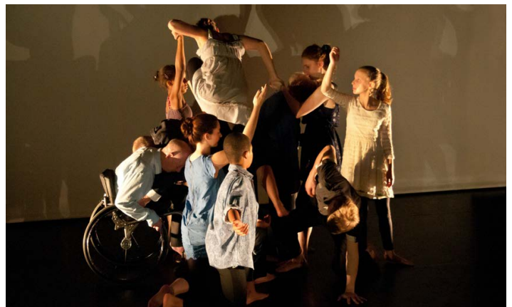
'Gifted' (2009) Crossover Dance Company for Pegasus Theatre, Oxford