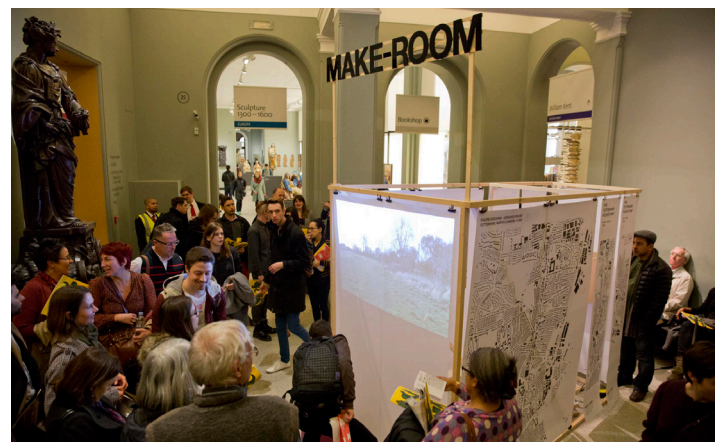
The Tottenham Takeover at the V&A Installation (2014)