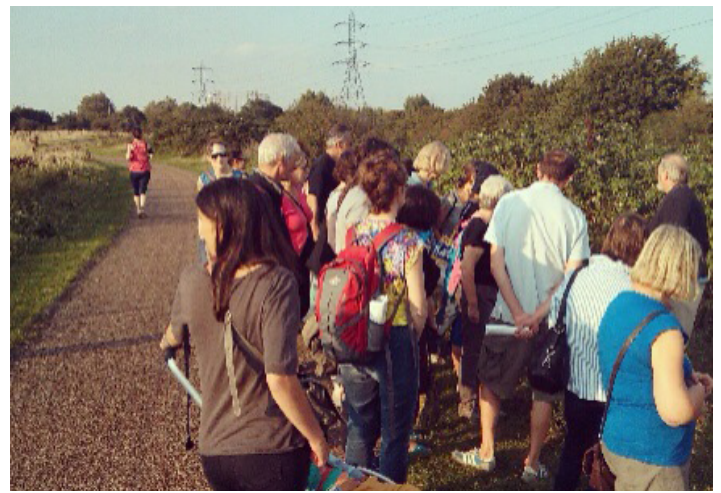
A Tottenham Walk a creative exploration of Tottenham by an artist, architect, conservationist & local historian (2014)

Foundation Diploma, Chelsea College of Art and Design (1999)